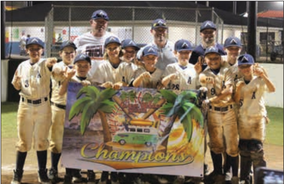
Special to SW Rankin News