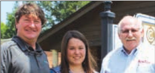
Special to SW Rankin News

ulation ever taking hold. If deploying after mosquito season is underway, have no fear: simply double your first deployment to bring the population under control. For optimal reduction rates, Eradicators should be replaced after each deployment period of up to ninety days until mosquito season ends. EDITOR'S NOTE: Spartan Mosquito Eradicators are available at Revell Ace Hardware in Clinton or Byram and online.