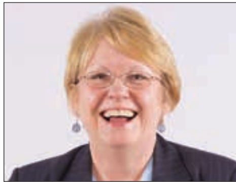
Special to SW Rankin News

SW Rankin News , purchased and re-branded for the July issue, covers three municipalities and has an estimated